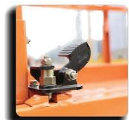
Platform Extension Footlock